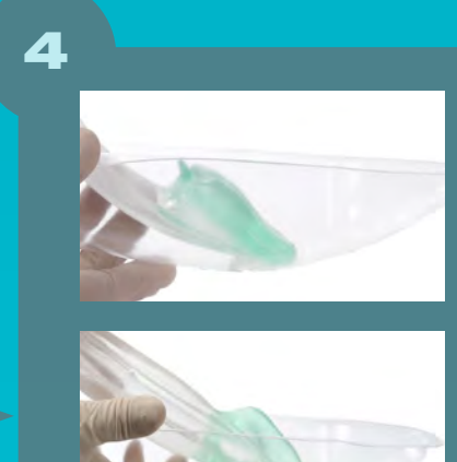
layer base (Ensu is rem inserti

Lubricate the back, sides and front of the i-gel O_2 with a thin layer of water based lubricant. (Ensuring any excess is removed prior to insertion)