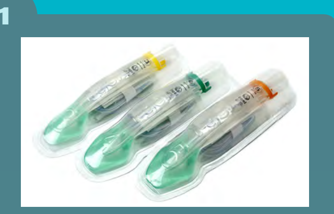
Using the size guide in the grid to the right, choose the correct size of i-gel O<sub>o</sub> Resus Pack for your patient.