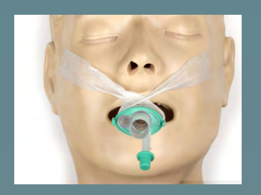
Alternatively the device can be secured by taping maxilla to maxilla.

Secure the device by sliding the strap underneath the patient's neck and attaching to the hook ring. Take care to ensure the strap is not secured too tight.