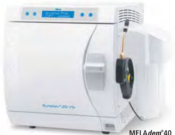
MELAdem® 40 mounted on the Euroklav® 29 VS+

Operating the autoclaves should be both pleasurable and safe. The design fully supports this demand. It shows what's essential, and does its work efficiently. The large door lock is not only a design feature, but also ensures a safe and easy opening and closing of the door.