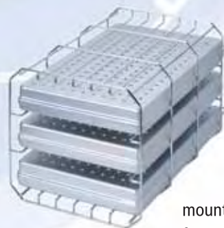
mounting „A“ (rotated) for 3 standard tray cassettes