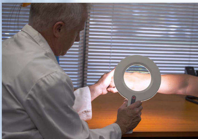
Ideal for skin inspection